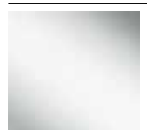
Clear code 1