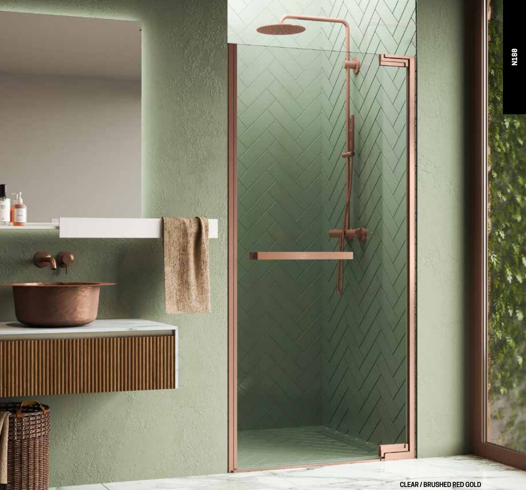
CLEAR / BRUSHED RED GOLD